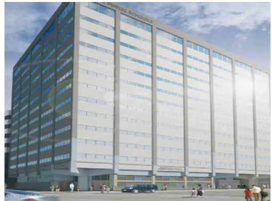
Emily Griffith Campus – Downtown Denver Expeditionary School, Emily Griffith High School and College and Denver Public Schools Administration offices, 2014