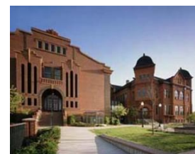
Dora Moore School, built 1889