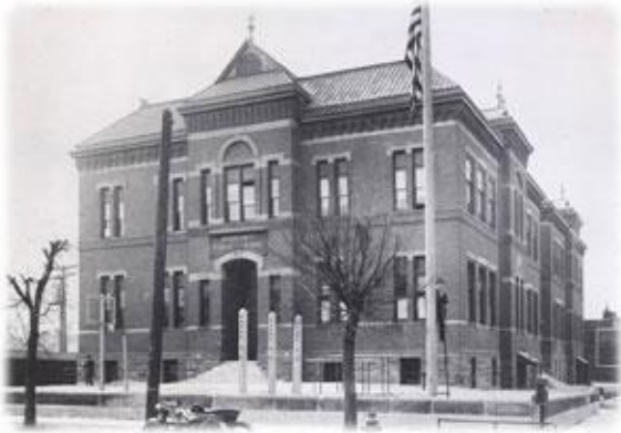
Emily Griffith Opportunity School in the old Longfellow School building, 1916